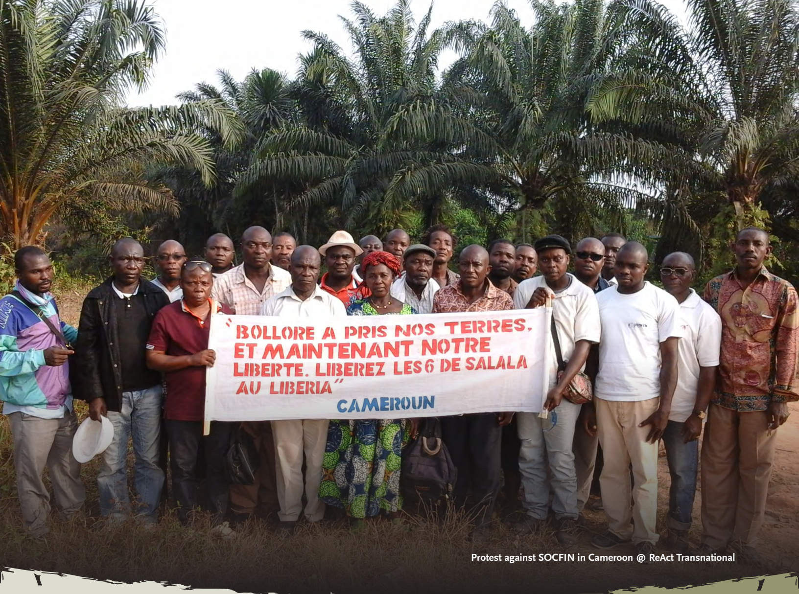
Protest against SOCFIN in Cameroon