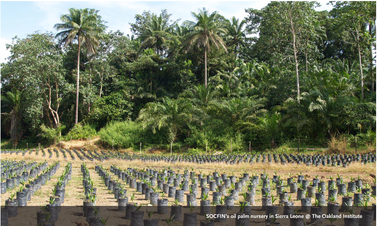
SOCFIN's oil palm nursery in Sierra Leone