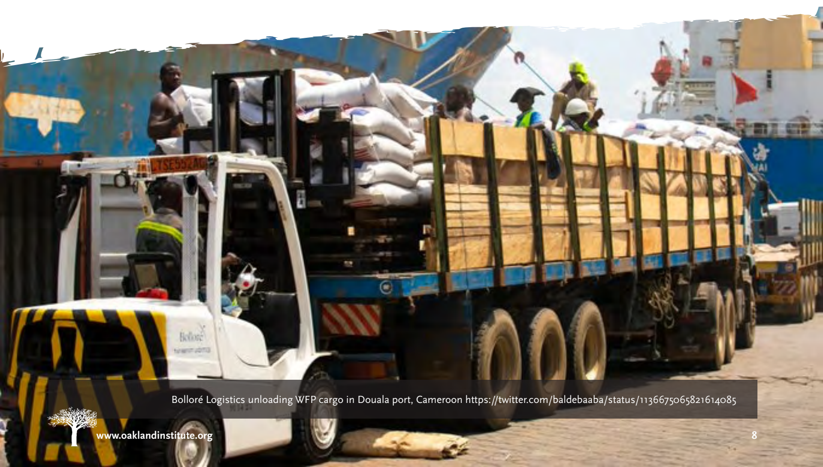
Bolloré Logistics unloading WFP cargo in Douala port, Cameroon https://twitter.com/baldebaaba/status/1136675065821614085

On February 23rd 2021, Vincent Bolloré and two other company executives pleaded guilty on corruption charges and accepted to pay a fine of 375.000 euros each to have legal proceedings against them dropped in the criminal case in Togo. Indicted for the counts of bribery of a foreign public official and complicity in breach of trust, the Bolloré Group recognized the charges and accepted to pay a fine of 12 million Euro (US$14,5 million) in the same case. However, the presiding judge rejected the deal with the three individuals, insisting that they stand trial under criminal charges. 28