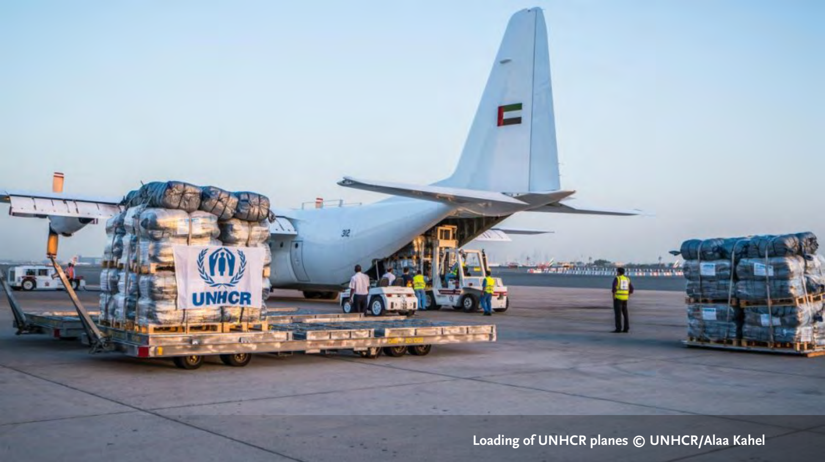
Loading of UNHCR planes