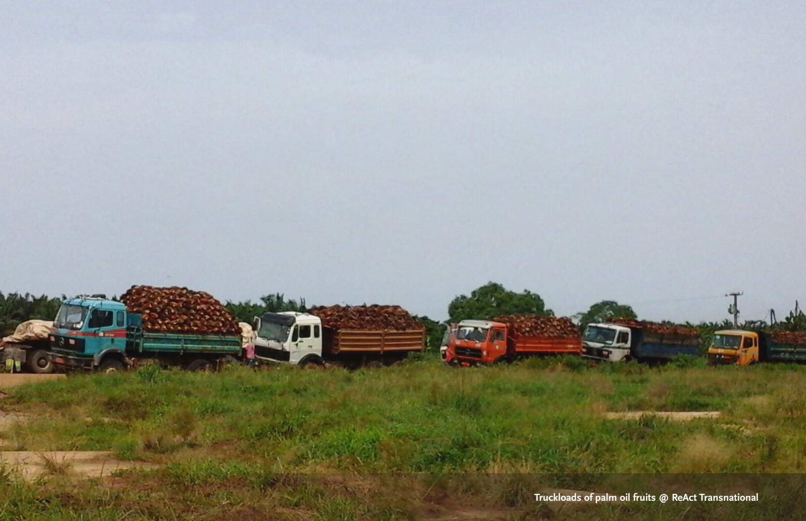
Truckloads of palm oil fruits @ ReAct Transnational

The Bolloré Group is a major supplier to the United Nations, which pay Bolloré over US$50 million every year for logistics and other services. Between 2015 and 2019, 1 different United Nations entities signed over 200 contracts with the Group, for a value of over a quarter billion dollars. The main clients were the United Nations Procurement Division (US$74 million), UNICEF (US$45 million), and World Food Programme (est. around US$100 million). 2 These numbers are very conservative estimates as data is not made public for a number of United Nations entities such as the World Health Organization and because many transactions are not made public. 3