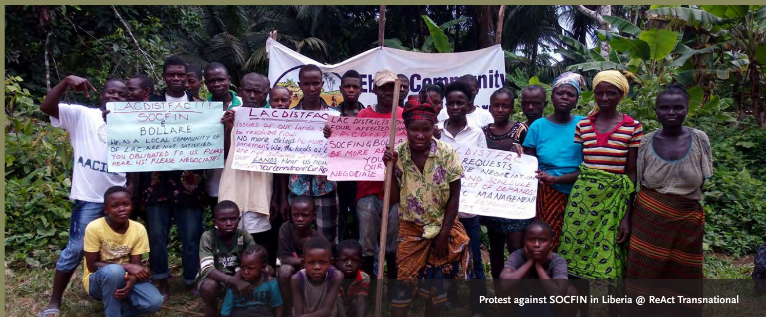
Protest against SOCFIN in Liberia @ ReAct Transnational