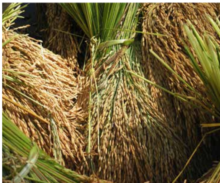
Rice Harvest in Burkina Faso.

This much maligned approach to increase family farmers' production carries tremendous environmental and socio-economic risks. Research shows that use of modified seeds, manufactured identically for a particular characteristic, leads to reduction of biodiversity. 55 Reduced biodiversity exposes plants to pests, thus improved seeds require increased application of pesticides and fertilizers, which are produced using oil (pesticides) and gas (nitrogen fertilizers). These increase yields in the short-run, but in the long-term they lead to water pollution and increased water use, deplete the soil of its nutrients, and contribute to climate change. 56