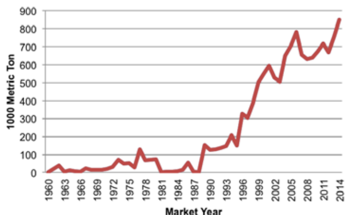
Figure 2: Increase in Guatemala Corn Imports, from 0 to 850 000 tons per year, 1960-2014

Guatemala’s example is not isolated; during the 2008 food crisis, food insecurity among countries that had adopted the large-scale export agriculture model was rampant worldwide. The FAO highlighted that the most vulnerable countries were those that bore “the highest burden of the increasing cost of imported food, with total expenditures by Low-Income Food-Deficit Countries (LIFDCs) some 35 percent higher in 2008 than in 2007—the largest annual increase on record.” 81 In dozens of countries, the increase of food prices generated great concerns over countries’ ability to keep financing cereal imports for their populations and possibilities of civil unrest.