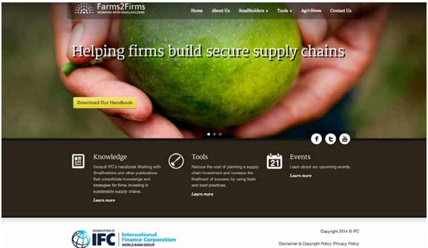
Website, Farm2Firms—Working With Smallholders. © International Finance Corporation, 2014.

Contrary to such methods, agroecological farming techniques such as crop rotation, agricultural diversification, multi-cropping, plant selection and breeding help sustainably maintain soil fertility 57 and biodiversity. For example, in Papua New Guinea, an average family grows between 30 and 80 species of food crops on their land. 58 As farmers select the best varieties of plants and maintain a diversity of crops to resist to droughts and pests, the Papua New Guinean smallholders are crucial guarantors of the country's food security. 59