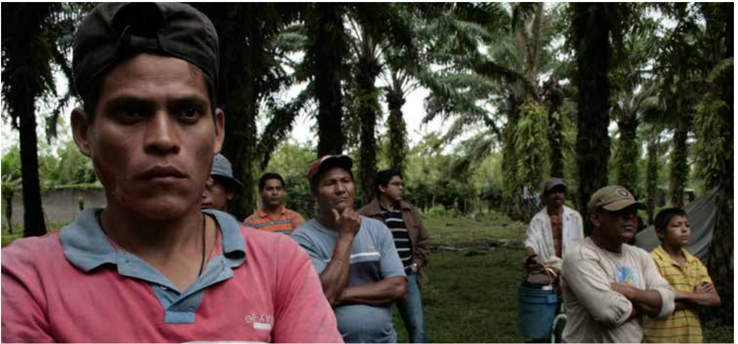
Farmers in Bajo Aguán, Honduras.

website and the BBA methodology was also recently removed from the web. 123 Predictably, both indicators constitute a clear favoritism for agribusinesses. BBA's goal is to "help policy makers strengthen agribusiness globally, enabling the farm sector to participate more fully in the market," 124 while the ABI aims at assessing "whether the countries have an enabling environment that is conducive to agribusiness investment, competitiveness, and ultimately agriculture-led growth." 125 Both indicators assess comparable areas, examining the availability of seeds, fertilizers to set, machinery and mechanisms for rural finance and access to market, considered essential to foster corporate interest in investing in countries' agricultural sector.