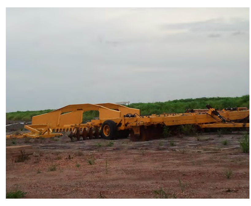
Farming equipment Concord Agriculture

"Since they have started, they have not employed our people. They just went to their area and left us here. It is not because our people cannot do anything. We are strong. We do not know why they are not hiring our people."185