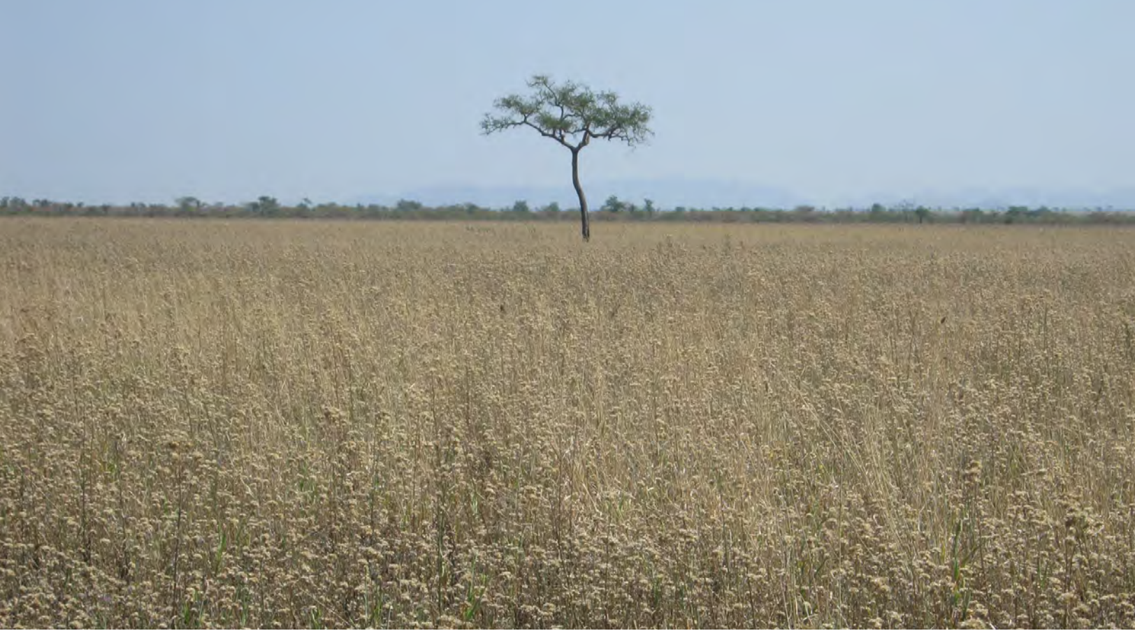
Habila mechanized schemes. Nuba Mountains

senior research fellow at the Hauser Center for Nonprofit Organizations at the Harvard Kennedy School, policies such as these reflect a common attitude among policymakers in South Sudan: