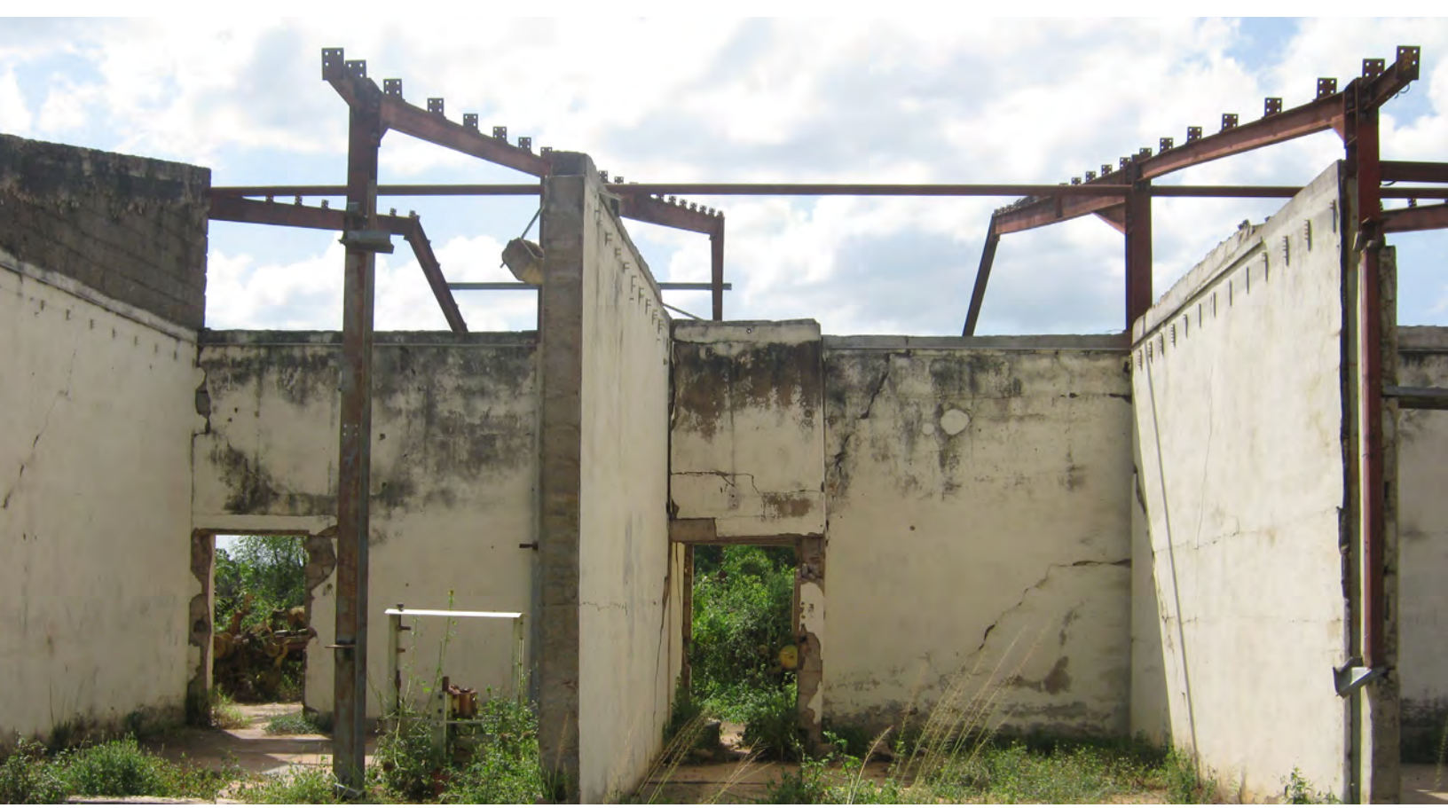
Defunct agro-industrial complex in Mangala which the Madhvani Group is hoping to revitalize

plantation forestry, agrofuel projects, carbon credit schemes and ecotourism projects were largely initiated under the radar. Companies moved in fast to secure large concessions and land leases in some of the most fertile and water-rich regions of the country. For the most part, however, they held off investing large amounts of money into developing the property, preferring to wait until the political uncertainty of the interim period had passed. As a result, although large areas of land were sought or secured by private actors—more than eight percent of South Sudan's total land area according to the study—there is relatively little evidence of investment activity on the ground.