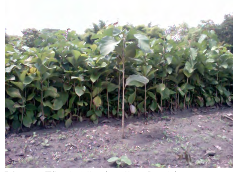
Teak nursery at ETC's project in Nzara County, Western Equatoria State

Finally, given the complexity of displacement and migration patterns in South Sudan, it is often difficult to determine which areas of the country are populated. Many communities were displaced from their ancestral homelands during the war and now, in the postwar period, expect to return to their homes to rebuild their lives. In other situations, displaced communities may choose to permanently settle in their new locations. Without a firm understanding of local histories and the movement of local populations over time, it is difficult to determine the importance of specific areas to host communities and whether they are in fact abandoned or merely left temporarily vacant.