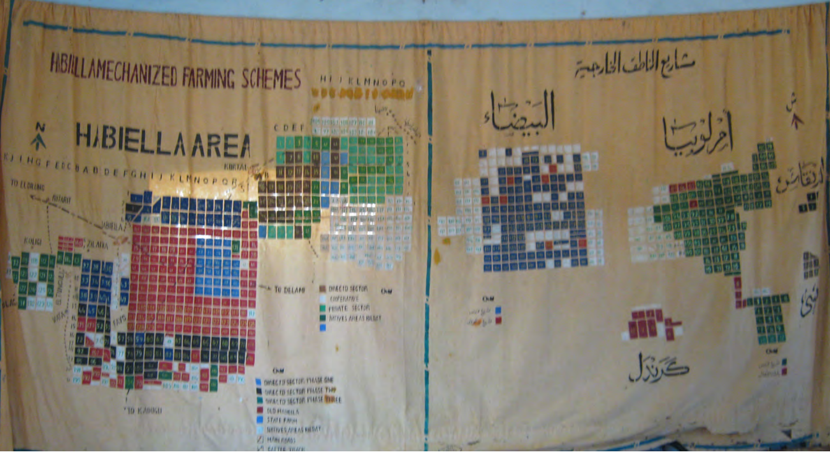
Locally made map of mechanized schemes in Habila, Nuba Mountains

involved in the process leading to the signing of these projects."87