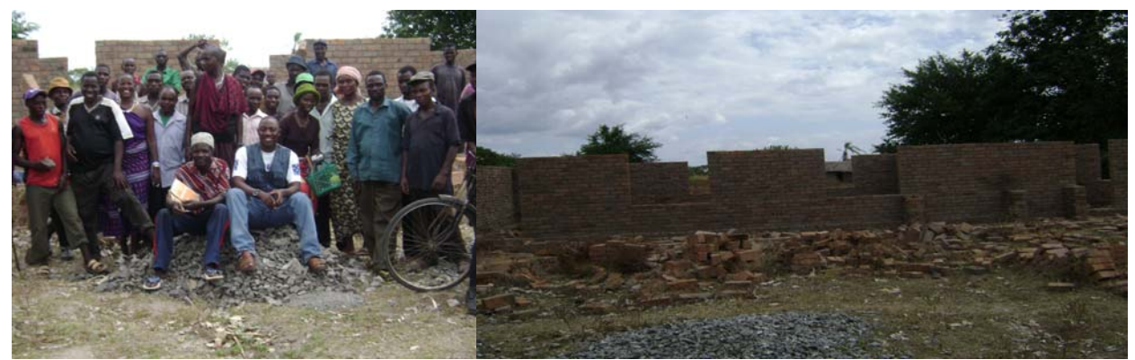
Photo 4: Kichangani/Isago residents together with enumerator in front of under construction primary school just outside the Mngeta Farm boundaries. (Photo by Juma Kayonko seated in blue jeans)