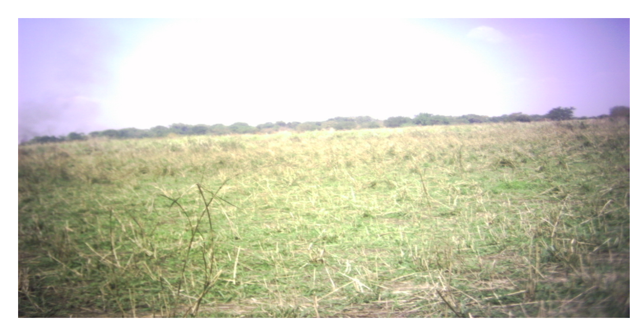
Photo 2: Part of formerly cleared Mngeta Farm characterized by open grassland

The formerly cleared part under rice production is characterized by regenerating grassland, which are used as grazing areas by the agro-pastoralists. ( Photo 2 ).