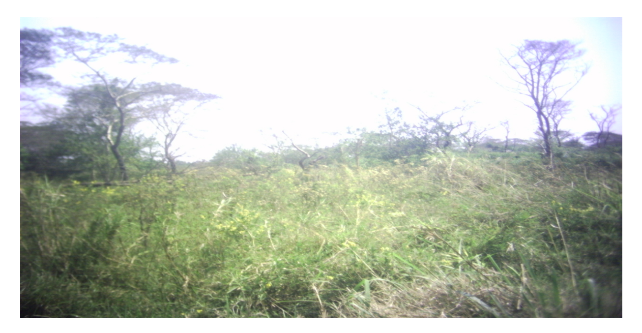
Photo 1: Part of uncleared Mngeta Farm characterized by dense grassland with scattered trees. (Photo by J.G. Lyimo, September 2007).

The formerly cleared part under rice production is characterized by regenerating grassland, which are used as grazing areas by the agro-pastoralists. ( Photo 2 ).