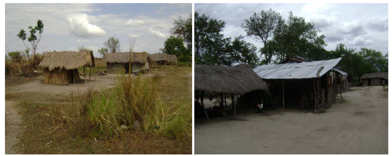
Photo 3: Common housing structures in Kichangani

Unfavorable price of the main cash crop, paddy, was mentioned as the main reason for poor housing in Kichangani/Isago sub-village. Although the price of rice has steadily been increasing as illustrated by Table 3 , individual households have not benefited much from this increase as the increase has either been leveled by galloping inflation rates or have been appropriated by greedy middle men. However, the people acknowledge that KPL has improved the road network leading to Kichangani/Isago, which for many years was hardly passable by any means of transport from Mchombe area, the closest small town.