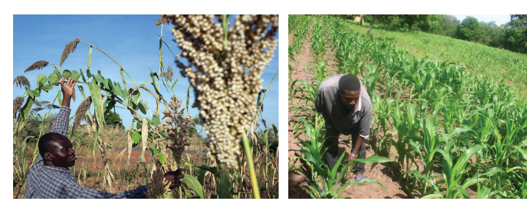
(L) Sorghum farmer.(R) Maize plantation in Sissako.

In Mali and across Africa, agroforestry has shown real and lasting results when implemented in a thoughtful and sustained manner. From improved soil fertility, increased crop yields and food security, agroforestry shows that simple measures can have profound effects on communities.