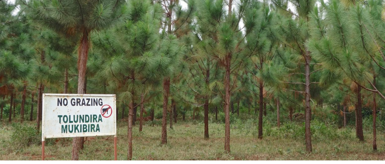
"No grazing" sign at Green Resources' plantations in Uganda