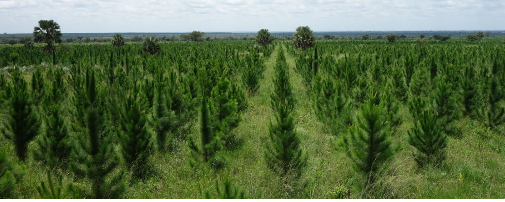
Green Resources' pine plantation in Kachung

The Kachung tree plantation established by the Norwegian firm Green Resources in Uganda has had a devastating impact on the local people and the environment. Eviction notices released along with this report are evidence that the project was established on land grabbed from local communities. The three Scandinavian governments that finance the project and the international certification bodies that have verified that Green Resources is adhering to social and environmental standards are aware of the land grab. And yet, they have chosen to turn a blind eye to the actions of Green Resources.