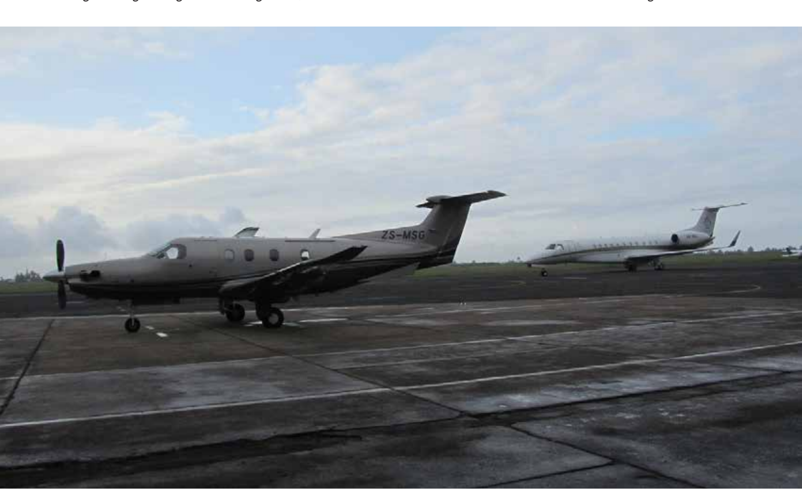
Private planes parked at airports: a common sight

Communities are encouraged to take steps to register their land rights formally. The first step is Delimitation (delimitação) in which a sketch map is registered in the land registry and a certificate (certidão) is issued by the Provincial Mapping and Land Registry Service (SPGC).45 A formal DUAT title requires a more precise and costlier mapping exercise called a Demarcation (demarcação), which includes the placing of cement markers at reference points around the perimeter. This is the same DUAT title as is used for a government-