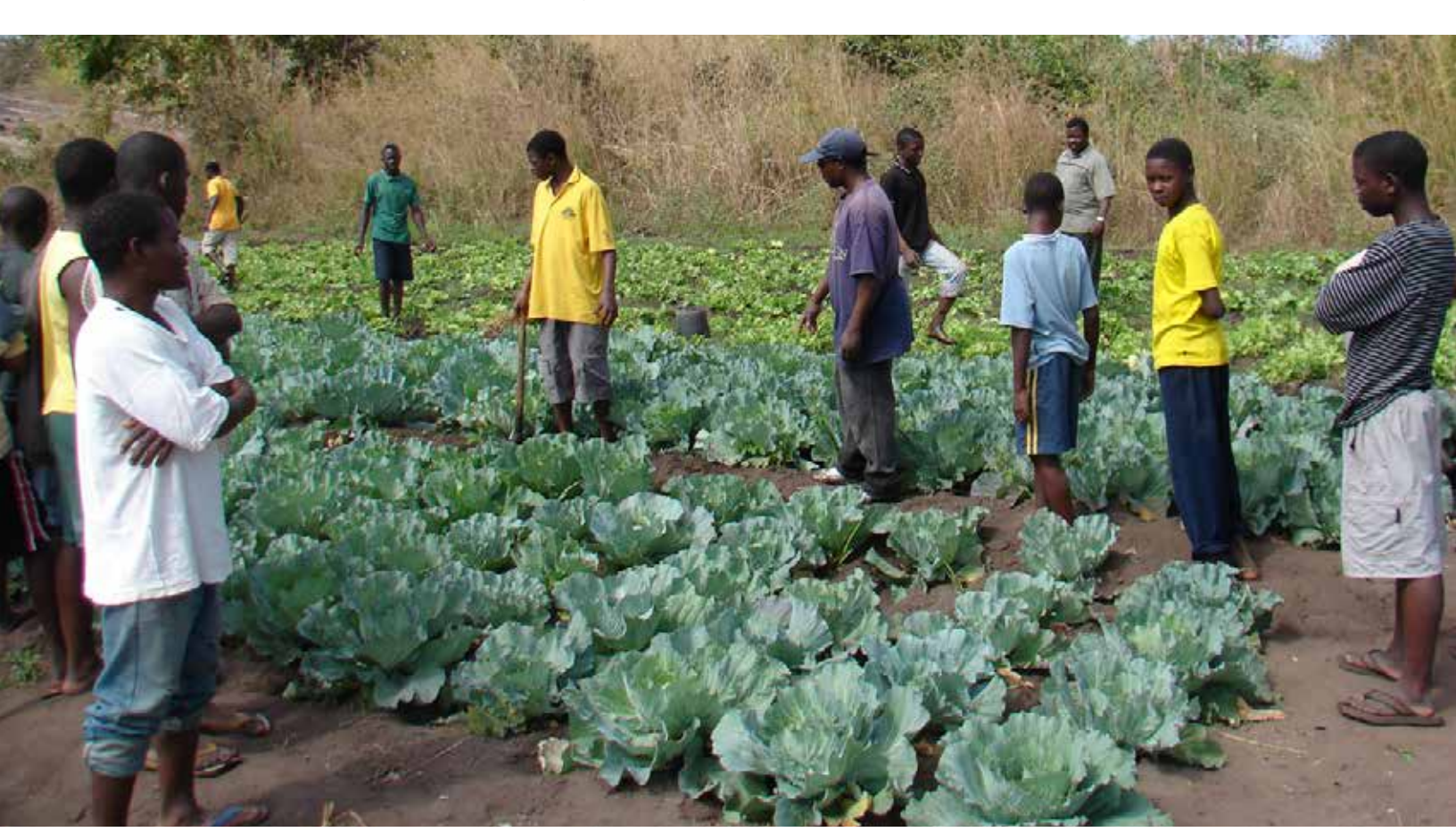
Students at the agricultural college in Ribaue

Multiparty elections have taken place in 1994, 1999, 2004 and 2009 (national) and 1998, 2003, and 2008 (municipal). Frelimo remains the ruling party, while Renamo is the main opposition party but its support has faded, and it has only 20 percent of the seats in parliament and controls no municipalities. There is a two-term limit on the presidency, and President Armando Guebuza, elected in 2004 and 2009, has