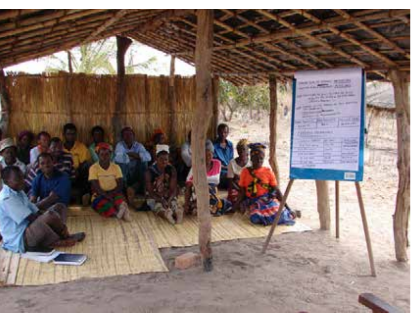
Farmers association meeting in Ribaue

almost completely absent." But its attitude was already beginning to shift, and in a worried comment, the Bank continued: "The non-interventionist environment is perhaps good to encourage private initiative, but on the other hand the private sector has not stepped in to provide fertilizers, agricultural machinery, seed and so on."34 The result is the total failure to develop more modern small and medium size agriculture in Mozambique. This hard line only began to soften in 2008, with the resumption of government and donor support for agricultural research.