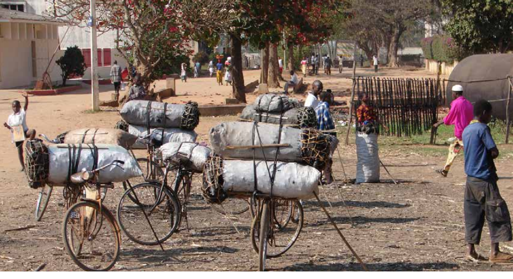
Charcoal market in Nampula, charcoal is an important forest product

Sun Biofuels is probably the most prominent, having taken over a 5,000 ha former tobacco plantation in Manica province. It initially focused on seed trials but has now cleared, prepared and planted 2,256 ha. Sun is 98.25 percent<sup>145</sup> owned by Trading Emissions, an Isle of Man (UK offshore) incorporated "closed end investment company that specializes in renewable energy projects and emissions instruments such as carbon credits."146 Sun operates in both Mozambique and Tanzania, and to date Trading Emissions has invested USD 27 million in Sun. Sun exported the first batch of 30 tons of jatropha oil produced from its fields to Germany's Lufthansa airline in August 2011. The same month, the company was reported to have been sold to Highbury Finance, a British-Dutch investment company.