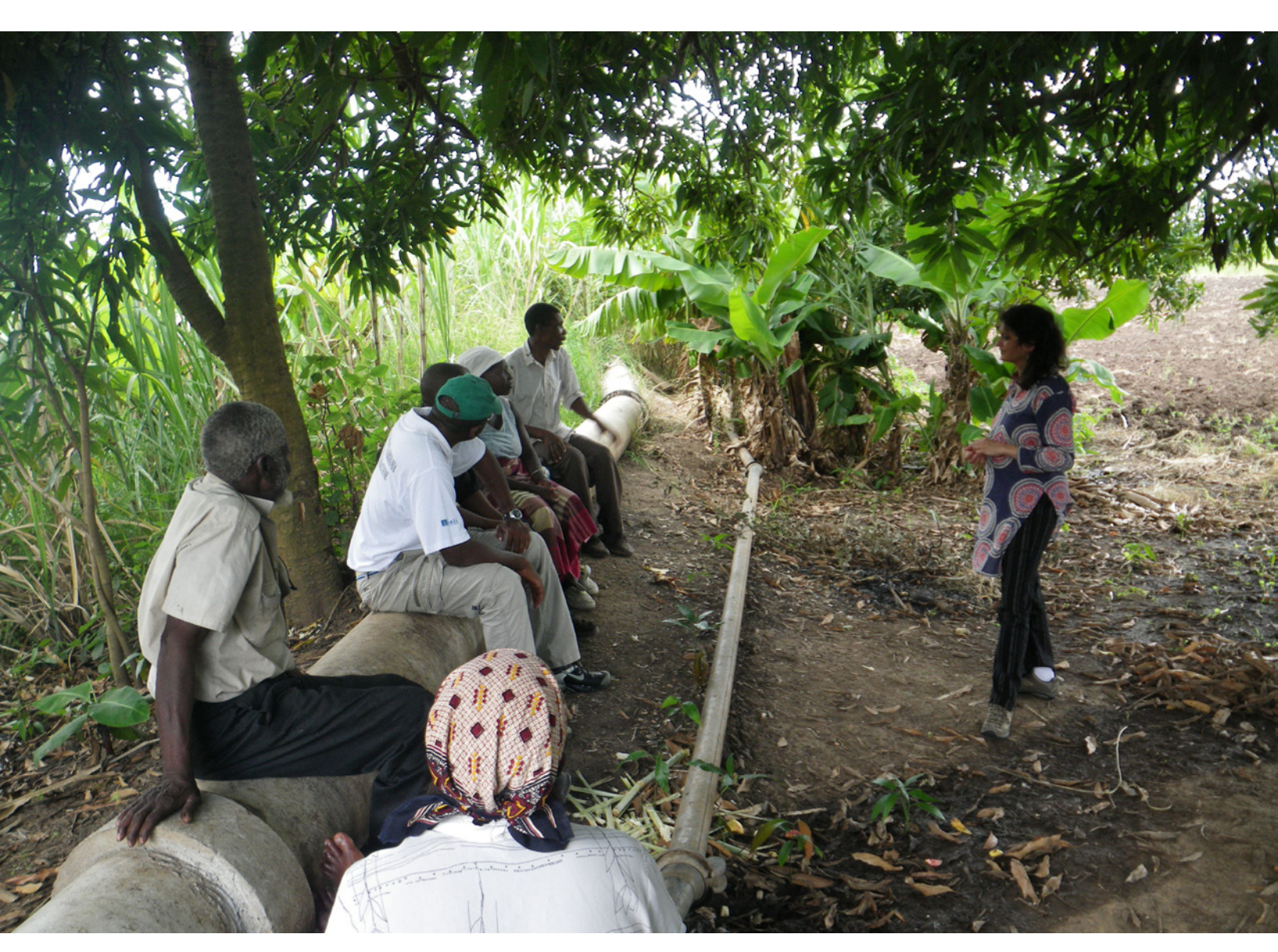
OI researcher meeting with the farmers from the Matuba village

Emergent Asset Management is the subject of a special OI report, "Understanding Land Investment Deals in Africa - Deciphering Emergent's Investments in Africa."160 Emergent describes itself as "an alternative investment firm which offers hedge fund and private equity strategies." Its African Agricultural Land Fund" promises "Target risk-adjusted returns [of] +25 percent per annum from combined soft commodity production yields and land price appreciation," although the fund also promises "socially responsible investing and economic sustainability." They also hope that "sustainable agricultural practices" will lead to "carbon credit generation."