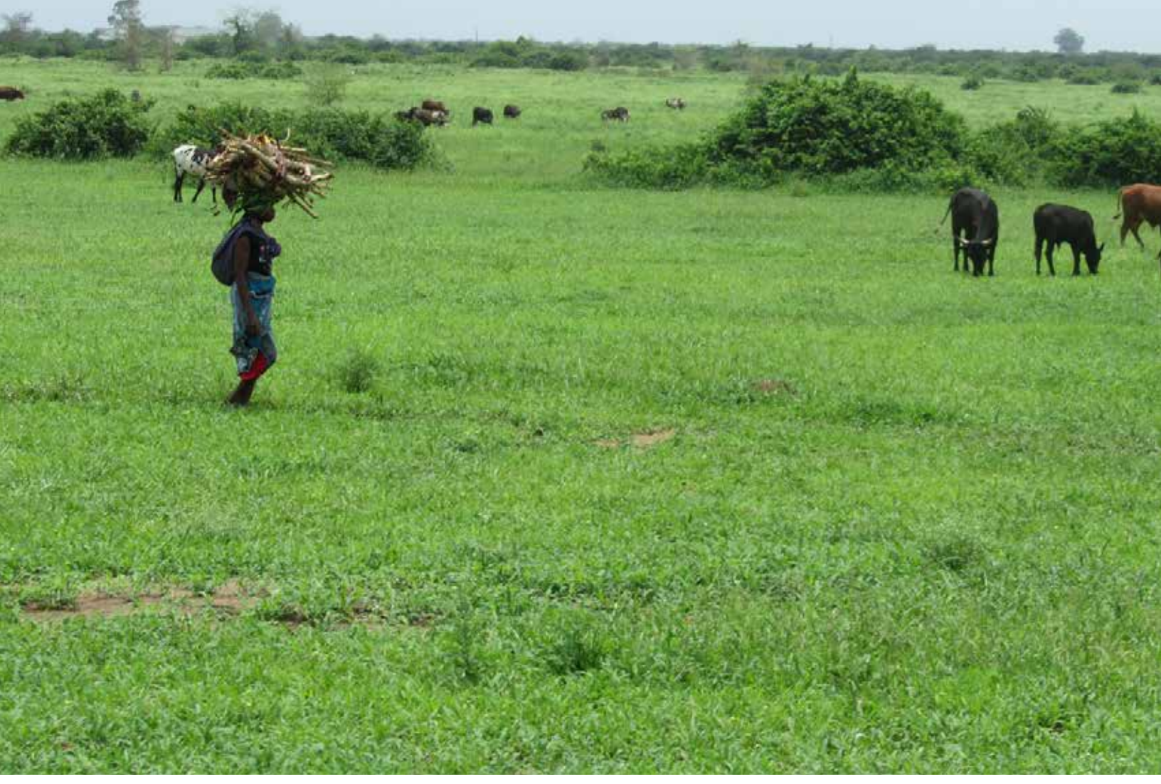
The myth of unused lands

of the guarantee for a 2001 loan for the rehabilitation of the Sena Sugar Estates85 (which did not involve a new land concession). The guarantees cover risks of currency transfer restriction, expropriation, war and civil disturbance for ten years.