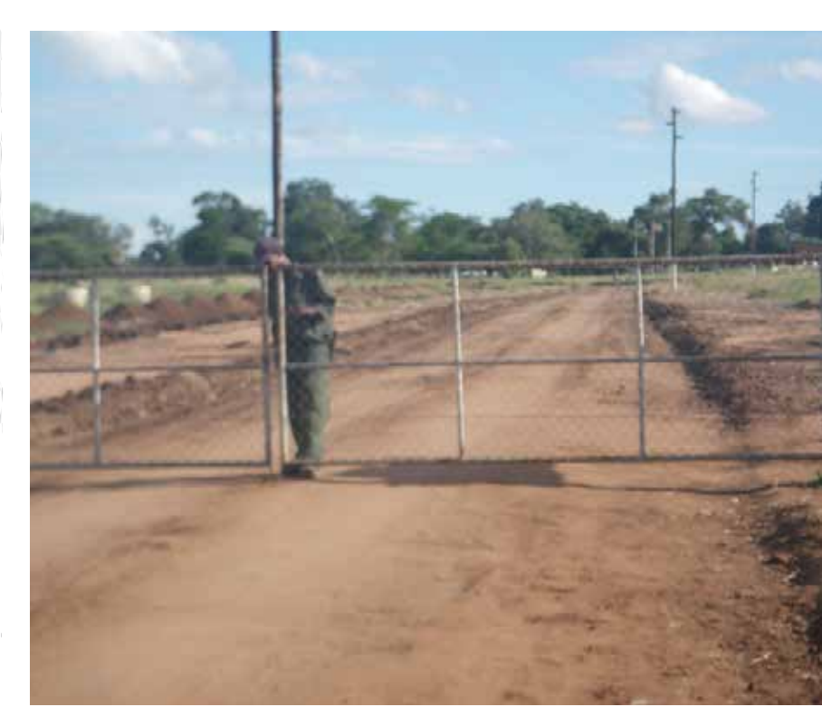
Entrance to the EmVest Limpopo Land Concession, Chokwe