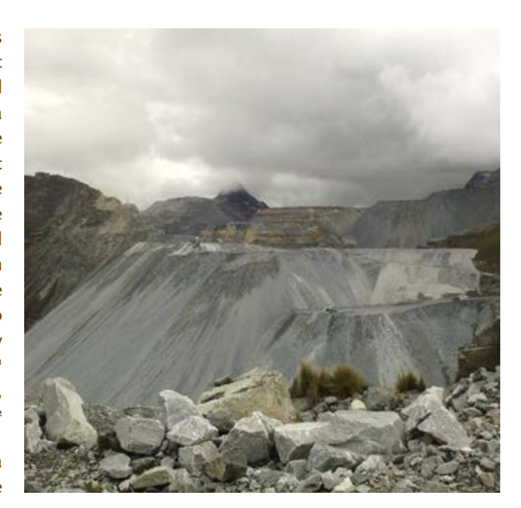
Antamina Mine, District of San Marcos, 2006.

Through its other private sector affiliate, the MIGA, the World Bank issued six guarantees totaling $107.5 million from 1999 to 2000 to support the Antamina mine project.46 MIGA's support to the Compañía Minera Antamina<sup>47</sup> also led to several complaints to the World Bank's CAO. These complaints were related to land resettlement issues (in 2000), water contamination in the bay of Huarmey, where Antamina's pipelines transport mine concentrates for shipping (2005), and ground water level changes due to the mine activity (2008).48 The conclusions of the 2000 complaint found that MIGA had not complied with the application of "policies relevant to indigenous people and resettlement, in addressing related social concerns, and the accessibility of the CAO to relevant MIGA document."49 However, Minera Antamina cancelled all guarantees with MIGA in 2007, avoiding further scrutiny from the CAO. In 2012, a pipeline from the Antamina mine broke, releasing