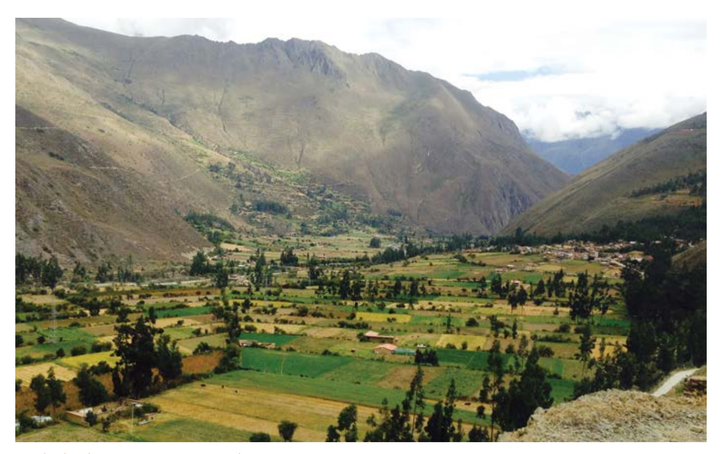
Agricultural Landscape in Moray, Peru, 2015.

Peru is the host the 2015 World Bank-International Monetary Fund (IMF) Annual Meetings, taking place in Latin America for the first time in over 40 years. The two Bretton Woods institutions, criticized for their record of lowering social and environmental conditions, seek to showcase Peru as a "success" of their neoliberal policies and reforms to the rest of the world.