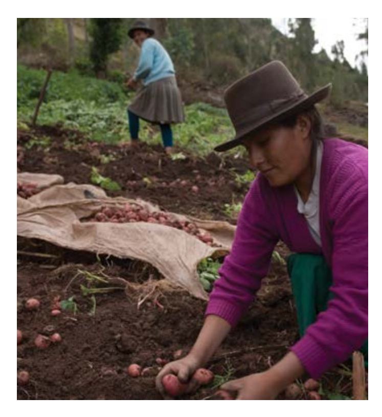
Harvesting potatoes in Manchaybamba, Andahuayla, Peru.