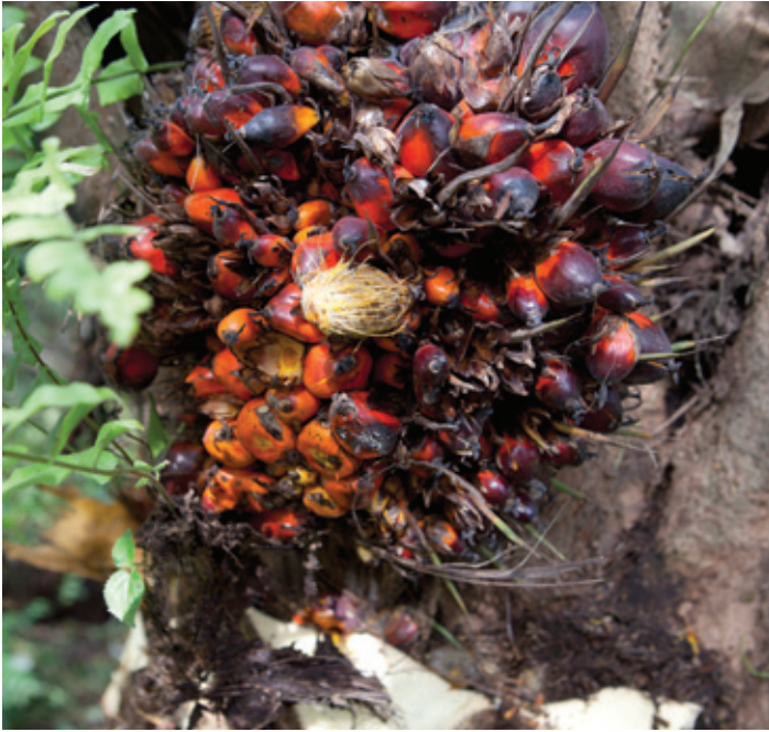
Palm seeds after harvest.

and sacred sites, as well as agricultural land used by the villages within the Concession, will remain.” 38 However, the assessment provides no explanation of how this will be done and no map is provided to demarcate the lands that will remain. 39 Furthermore, an independent assessment by the High Conservation Value Resource Network Technical Panel has shown the High Conservation Value (HCV) assessment SGSOC commissioned to be deeply flawed. 40