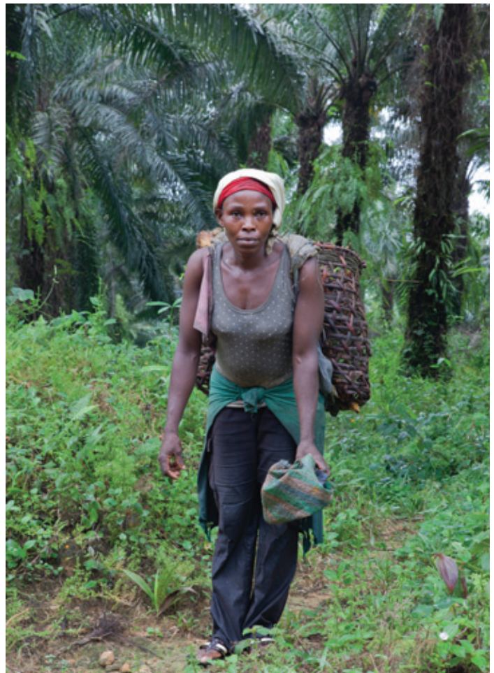
Worker in a palm oil plantation, Cameroon.

–Olivier de Schutter, the UN Special Rapporteur on the Right to Food, commenting on the SGSOC deal, July 2012. 29