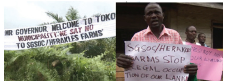
People say no to SGSOC; a protest in Toko village against SGSOC in June 2012.

Prior to these recent protests, several communities, including Fabe, Massaka-Bima, Mbile, and Mundemba, sent complaint letters and petitions opposing the project to the government. 58