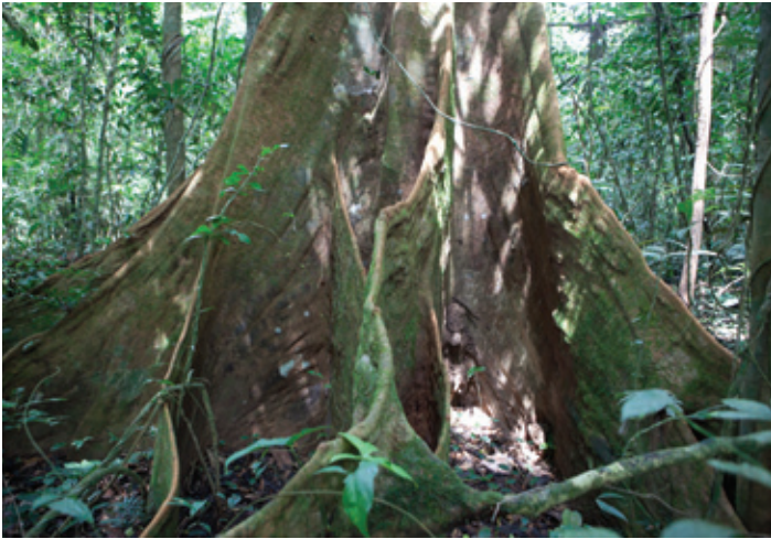
Old growth tree in the tropical rainforest Herakles Farms is planning to clear.

Beyond the sustainability argument, the investor puts forward an economic rationale for the project: Africa imports four million tons of (palm) oil a year. Therefore, it makes sense to develop palm oil production on the continent to reduce the import bill of African countries. Moreover, the CEO, Bruce Wrobel claims that “the native trees produce less than one ton per ha [whereas] we will be producing 5.5 tons per ha. [...] Therefore, the land required with modern commercial farming techniques would be more than 5 times as productive leaving significantly less land pressure.” 70 However, the facts show a different reality.