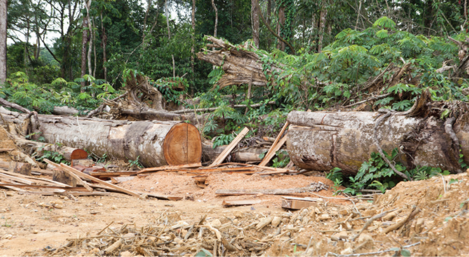
Timber left next to the Herakles Farms palm oil nursery in Fabe Village.

A 2012 comprehensive study on the SGSOC deal by two Cameroonian NGOs, the Centre for Environment and Development (CED) and Réseau de Lutte contre la Faim (RELUFA), 30 found that “whereas the Cameroonian Government currently spends massive sums subsidizing imported food stuffs to slow inflation on the local market, this spending could be significantly reduced if the government supported local production for domestic consumption instead of agro-industrial plantations oriented towards the export market.” The report further explains that “if the Government of Cameroon were to require bread-makers to use 20% locally produced flour (derived from sweet potatoes, corn, or cassava), 96,000 farming jobs would be created using just 15,000 ha of land. This would generate 13 times more employment and significantly larger government revenue than the SGSOC project and would leave additional lands available for peasant agriculture, conservation, and use of non-timber forest products.” 31