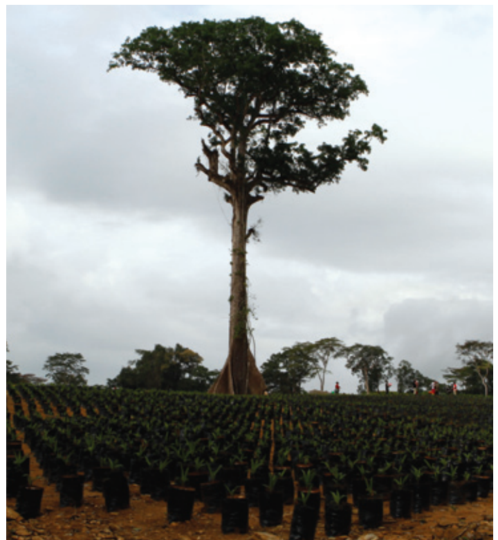
The Fabe nursery, run illegally by SGSOC.

There is actually a big difference between planting forest and planting palm oil trees, the latter is what All for Africa is actually aiming at in Cameroon. This is happening with a backdrop of silence regarding the fact that massive deforestation of tropical rainforest will be required so that palm oil trees can be planted. In 2008, it launched its "Palm Out Poverty Campaign" at an event in New York, 64 to initiate fundraising to finance the planting of one million palm trees on the Herakles Farms, as part of the 73,000 ha palm oil plantation. It claims that the one million trees will provide 750 million dollars of revenue that will in turn finance development projects on the continent. 65 The plan is to divide up the one million trees into 1,500 "oil trusts" that would then be allocated to existing NGOs working in several African countries to provide them with funding for one of their projects." 66 Wrobel claims that this business model is sustainable because it will generate long-term revenue streams to fund these NGO programs, 67 an element "missing in many development projects." 68