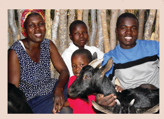
Families maintain small livestock for manure and milk production. Chris Woodring

This case study was produced by the Oakland Institute. It is copublished by the Oakland Institute and the Alliance for Food Sovereignty in Africa (AFSA). A full set of case studies can be found at www.oaklandinstitute.org and www.afsafrica.org.